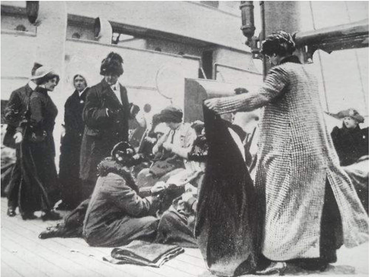
On board the Carpathia