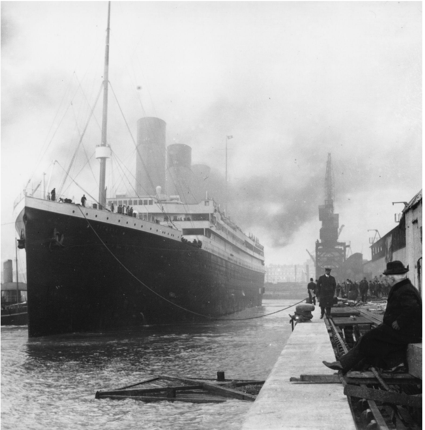
The Titanic tied up.